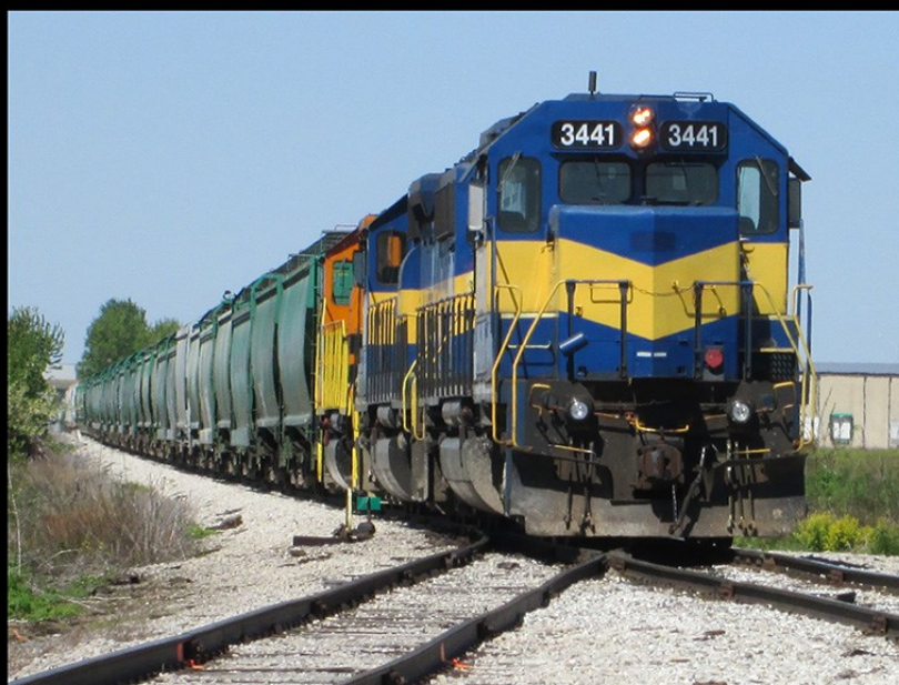
West Kentucky NRHS Chapter Photo Contest Fourth Place May 2017

Locomotive 585 on the lead crossing the Red River headed south on CSX's Henderson Subdivision at Adams TN on May 5th 2017