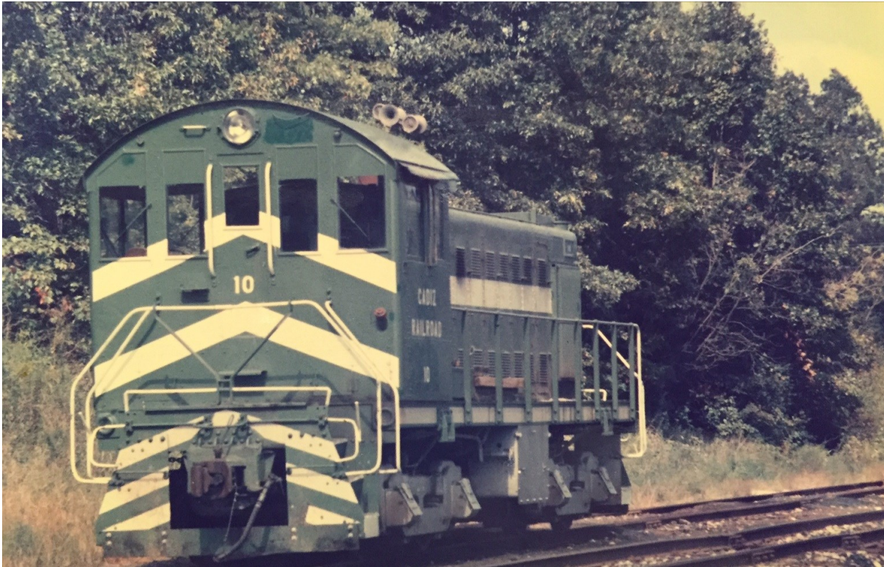
Former Cadiz Railroad Alco S-2 sitting in the former Illinois Central Railroad, Princeton KY. yard around 1986.