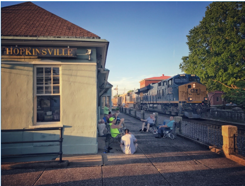
A SB loaded coal train makes its way past members of the West Kentucky Chapter of the National Railway Historical Society meeting at the depot in Hopkinsville, KY on CSX's Henderson Subdivision.