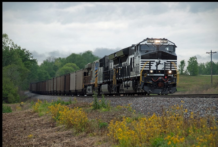
West Kentucky NRHS Chapter Photo Contest Second Place May 2017

Northbound CSX mixed freight departs from the siding at the south end of Kelly, Ky as it heads south on the Henderson Subdivision.